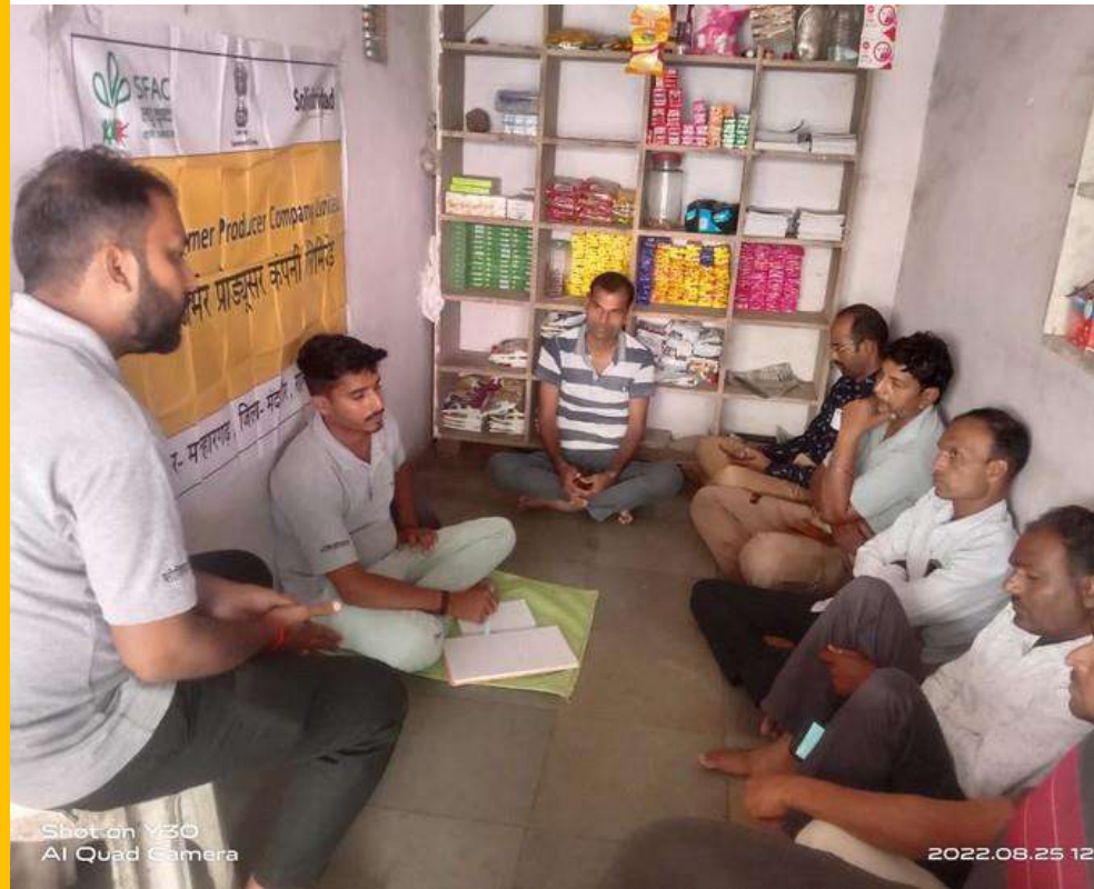
Shot on Y30 AI Quad Camera

Solidaridad and its partners encourage FPOs and assist farmers in materializing their resources to emerge as self-sustaining FPOs in their areas. In the month of July 2022, many capacity building trainings and meetings were organized for the Board of Directors' (BOD) and FPO members across the project districts of Madhya Pradesh. Rural Entrepreneurs have been trained to provide support in the programme activities of the project villages and promote advisory services within the groups of farmers. In this month about 60 rural entrepreneurs have extended training support to farmers on good agriculture practices.