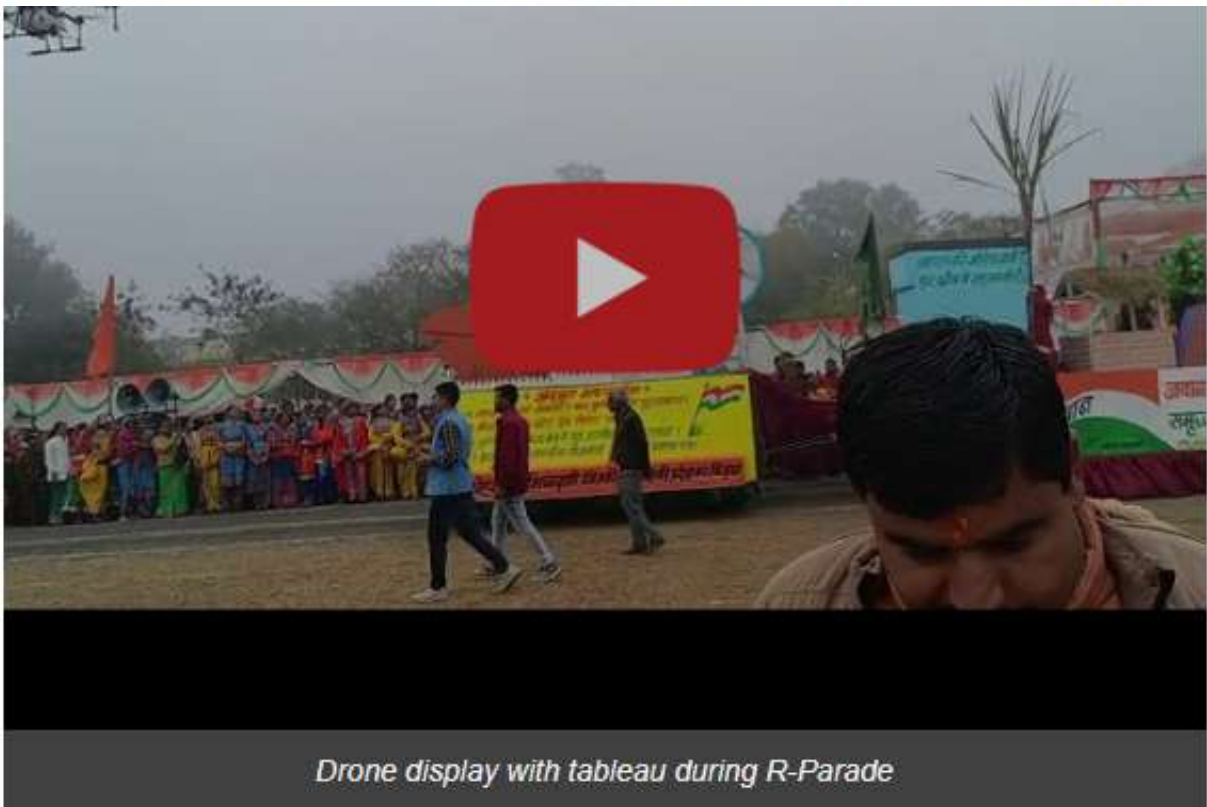
Drone display with tableau during R-Parade

Solidaridad jointly with Department of Agriculture of District Sehore, Madhya Pradesh participated in tableau display on Republic Day Parade, which awarded with the first prize declared by District administration. Solidaridad gave a live demonstration of Drone technology using in agriculture in tableau display.