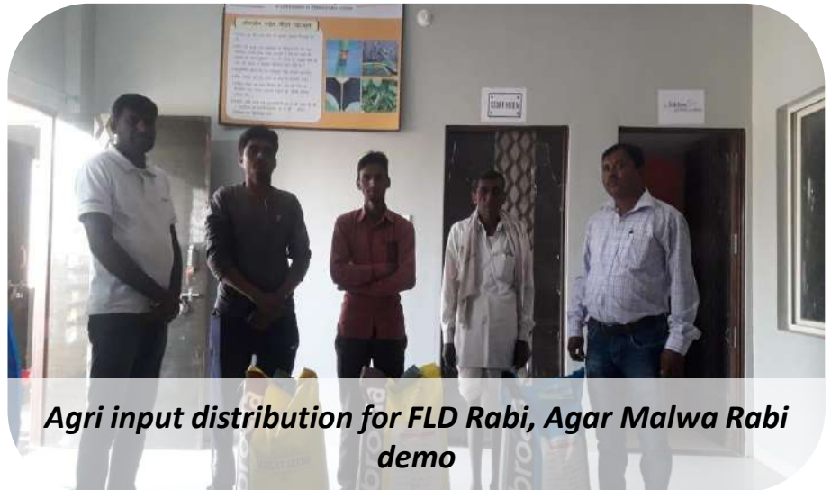
Agri input distribution for FLD Rabi, Agar Malwa Rabi demo

provided with critical inputs like Seed , bio fertilizer, bio pesticide ,micronutrient , vermi-compost. Farmers are being given hands on training and demonstration on seed treatment, sowing method, land preparation as per the training calendar.