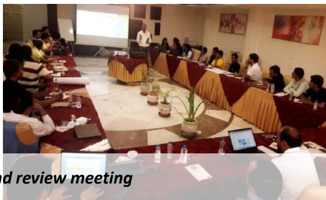
Team Planing and review meeting