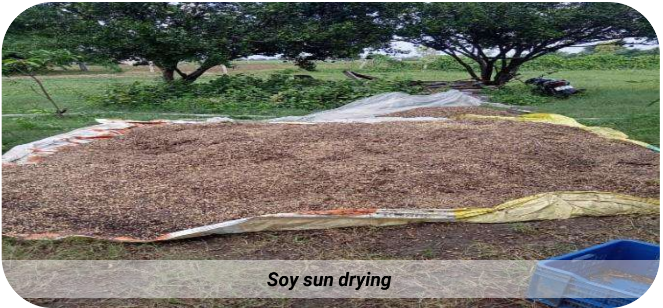
Soy sun drying

Due to occurrence of prolonged dry spell in this year of Kharif at the beginning of June-July , the sowing operation of Soybean got delayed up to mid -October . This led to delayed harvesting of the crop which lasted till October end. The late sowing of crop was managed with increased seed rate by 25 % and also reducing the inter row-spacing of the crop from 45 cm to 30 CM. These crop resilient methods ad advised by our subject expert proved helpful to overcome climate induced challenges and help farmer obtain optimum yield. With the beginning of the month, our prime focus was to create awareness about right harvesting stage and postharvest practices.