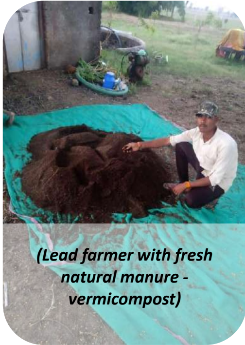
(Lead farmer with fresh natural manure - vermicompost)

The Tetra pack which was earlier provided to farmers in all project district is now ready with its first batch of good quality vermi compost and the farmers have engaged themselves in proper extraction. Farmers are now across all the district are now applying this Vermi-compost in to the soil during their pre sowing land preparation of Rabi this year.