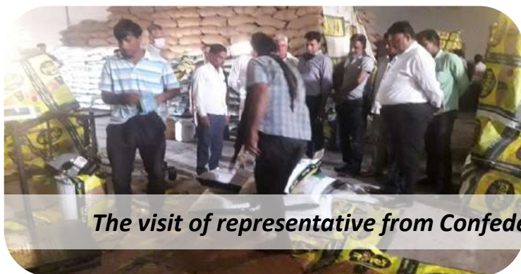
The visit of representative from Confederation of Indian Industries (CII)

In district Dewas, Diwasa Producer Company was registered on 2nd September, 2020 under the companies act of 1956 Part IX A. After the registration of FPO, the board members have mobilized 350 shareholders with the support of Solidaridad. The FPO generates Rs 3, 50,000/- as share capital. To start with the available capital, FPO have started small business initiatives and have demonstrated the successful models on small scale business activities around aggregation of quality seeds, packaging materials and custom hiring center. They are planning to expand their business in trading of commodities like soybean, wheat and chick-pea.