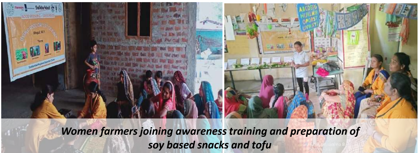
Women farmers joining awareness training and preparation of soy based snacks and tofu

The children and women in rural areas also suffer from deficiency of Vitamins and minerals which we call as hidden hunger. The prime focus of this awareness programme was to sensitize the community to make use of locally available resources which is rich source of all nutrients and vitamin. Women were given orientation on dietary sources from cereals, Pulse, Vegetables, oilseeds. Members also took part in demonstration of preparing soy based food like soy sweet, Tofu, snacks, Soy Milk, etc.